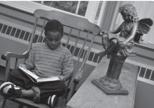
by Renee Landuyt place it in your office or waiting room, you will be captivated by the full-color images.

Proceeds go back to the Grosse Pointe Foundation for Public Education for future grant programming in our schools. The GPFPE covered the cost of printing and is using the book as its latest fund-raising initiative. This is a small but significant way our community can show they support the work of